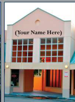
Monument and pop-up signage available